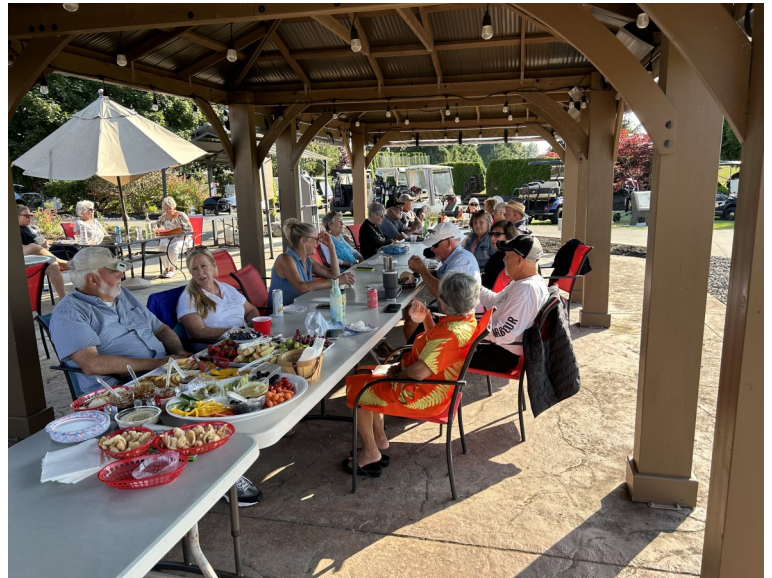
Above: Golf Club members enjoyed a delicious spread at the awards ceremony.