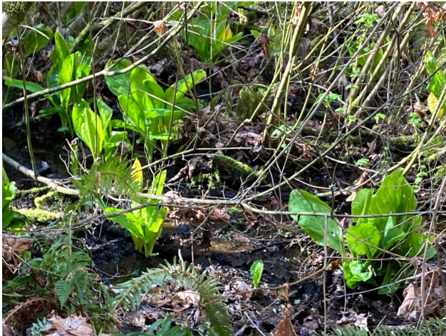
Glorius, odiforous native Skunk Cabbage Now in bloom

Gardens at the Front Gate, around the Clubhouse and at the Office will still be our focus as we help our Landscape Manager and crew finish the installation of waterwise, drought tolerant, native plants and supporting plants. These landscape changes should save a lot of watering and landscape maintenance costs as they mature.