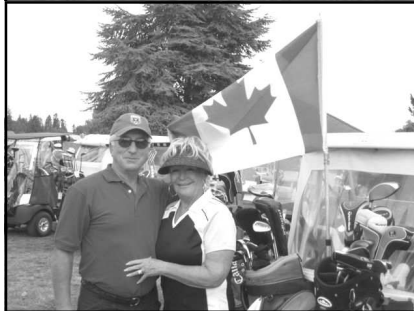
With patriotic enthusiasm, "Team USA" claim victory in the 1st Annual BBV Can-Am Ryder Cup golf tournament. Page 4